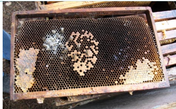
Frame of honeybee hive showing signs of Colony Collapse Disorder: there are reserves, brood, but only few bees

The specific cause(s) of colony collapse has not yet been identified. Some argue it is a virus, others say it is climate change. But there is growing support among scientists and members of the bee-keeping community for the hypothesis that neurotoxic pesticides play a role. Indeed, the available data appears to show a high correlation between the countries experiencing the greatest bee losses and those that have highest pesticide use 3 . A previous example of