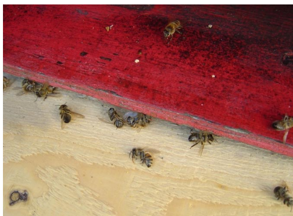
Observation of the hive in the early morning : dead bees in front of the hive entrance

So far, the impact of this chronic exposure to contaminated food and water sources on bees and their colonies has been completely ignored in safety assessments. Only acute toxicity, considered as the adverse effects of a pesticide resulting either from a single direct exposure (or from multiple exposures in a short space of time, usually less than 24 hours), and in certain cases the toxicity for larvae has been evaluated. In addition, the methodologies used to assess the impact on adult bees and the colony as a whole do not take account of the long-lasting presence of pesticides in the environment.