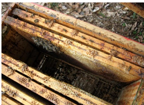
Suspected case of Colony Collapse Disorder : bees have abandoned the hive.

Secondly, the ICPBR's proposal failed to include an evaluation the chronic toxicity of pesticides 15 . Instead, it proposed measuring the toxic effect only if the pesticide shows problems in the short-term (acute toxicity).